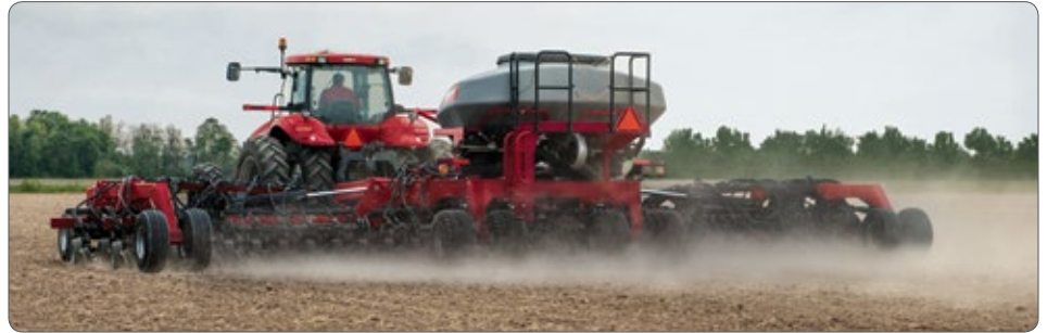
Case IH Precision Disk™ single-disk air drills deliver best-in-class seed placement accuracy for an array of crops grown in diverse conditions and geographies. At the heart of each Precision Disk drill is a completely new row unit with 10 unique features that all contribute to seed placement accuracy. It is engineered to help Case IH customers achieve more even emergence and improved plant stand establishment when seeding crops like soybeans, wheat, milo and hybrid rice.