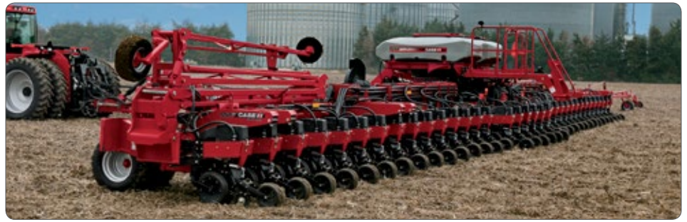
Case IH Early Riser® planters are designed with agronomics in mind and have multiple, patented features. The legendary Early Riser row unit has 12 unique features that all contribute to earlier, more uniform emergence, as well as an Advanced Seed Meter for accurate in-row spacing and population control.

Visit www.CaseIH.com/Agronomic Design to learn more about agronomic considerations when planting or seeding.