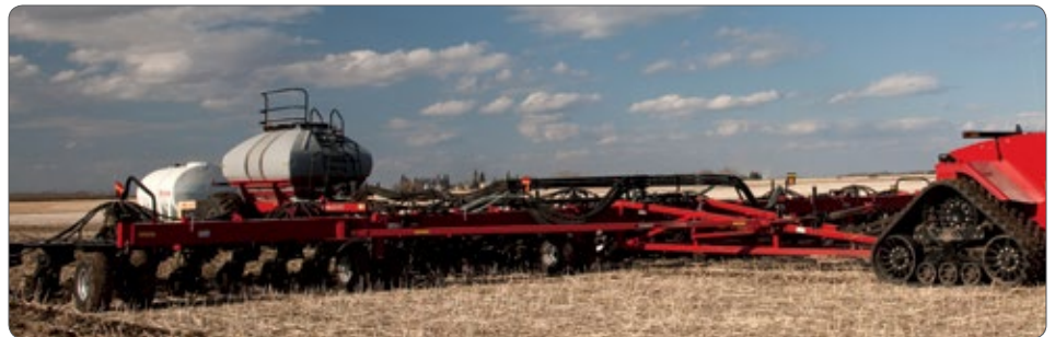
Case IH Precision Hoe™ air hoe drills deliver precise seed and fertilizer placement, making it ideal for seeding high-value, small-seed crops on large acreages. It combines precise control with rugged reliability thanks to the patented, parallel-link row unit and unique single-shank design that offers good residue flow in uneven terrain and tough no-till conditions.