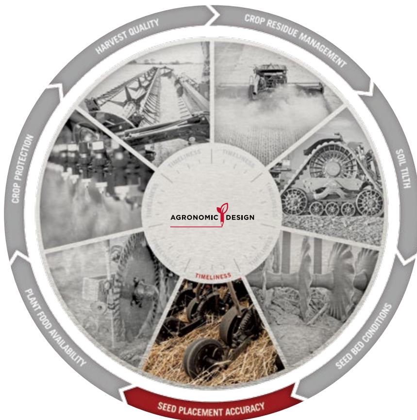
Agromomic Needs for Successful Stands

The term “picket fence stands” is used in the industry to describe uniform spacing between corn plants. However, research demonstrates that having “photocopy plants” actually has a greater impact on yield for corn. While other types of seed, besides corn, may be less susceptible to spacing issues, soybeans, canola, rice and other seeded crops can be very sensitive to planting depth, so producers need to be careful and get their crop off to a good start. When selecting a planter or drill, growers weigh many considerations. However, if the seed isn’t planted in a way that maximizes yield potential, there will be an immediate impact on profitability.